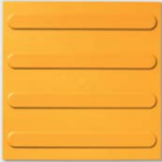
Safety Yellow (Rail and Bus Authority approved)